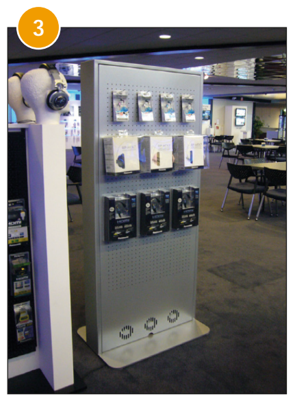
Portrait KioskPanasonic 47 inch Silver-Grey