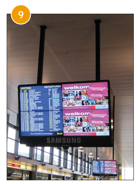
Matrix 4x4 Samsung 46 inch