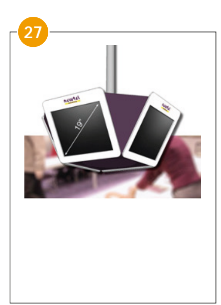
Concept: Diamond matrix LG 19 inch