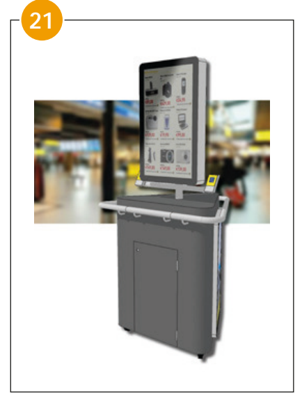
Concept: Mobile furniture ELO 42 inch