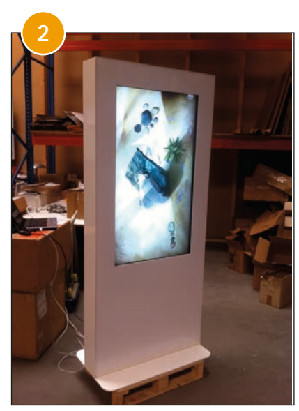
Touch Kiosk C-TOUCH 46 inch White