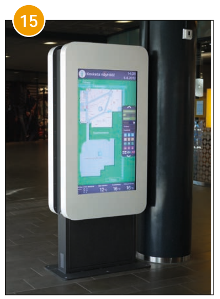
Back to Back Kiosk Hyundai 46 inch