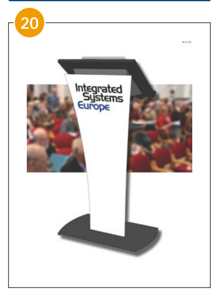
Concept: Lectern Laptop 15 inch