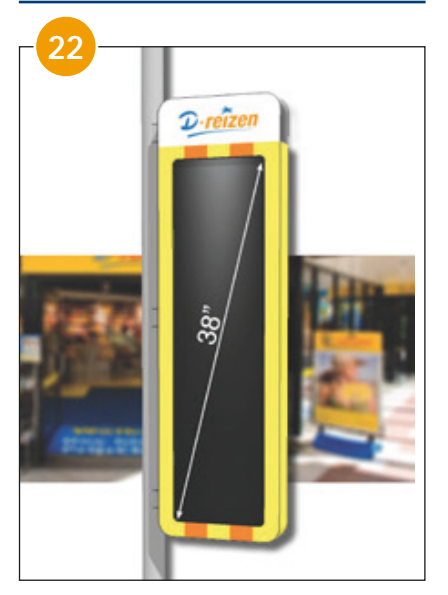
Concept: Window display LG 38 inch