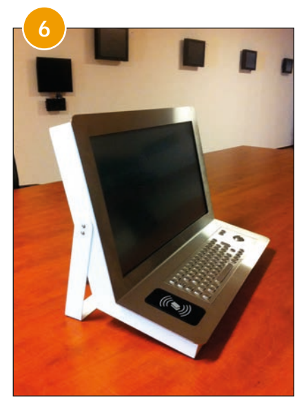
Internet Kiosk ELO 22 inch