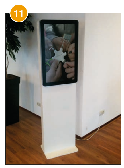
Touch Kiosk ELO 40 inch