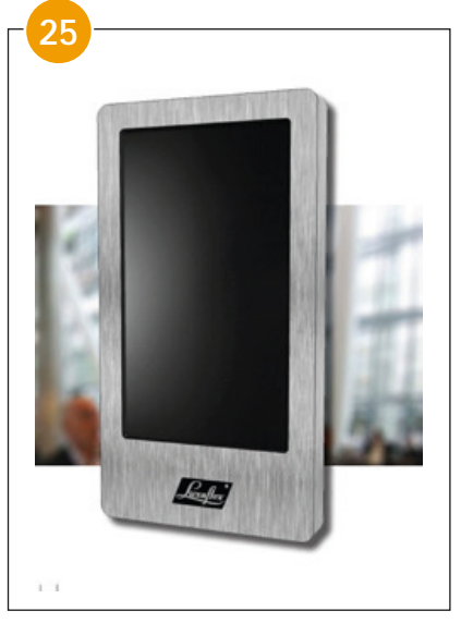
Concept: Flatscreen cover ELO 32 inch