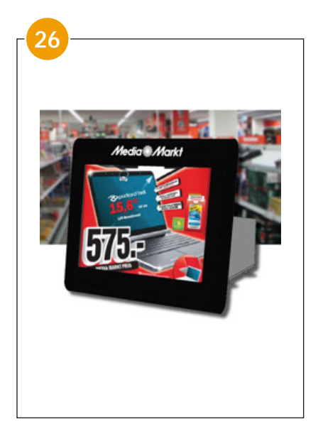
Concept: Shelf display for Tablet 10 inch