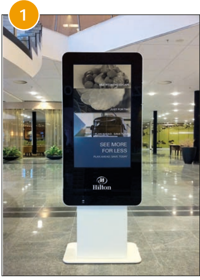
Touch Kiosk C-TOUCH 46 inch White/Black