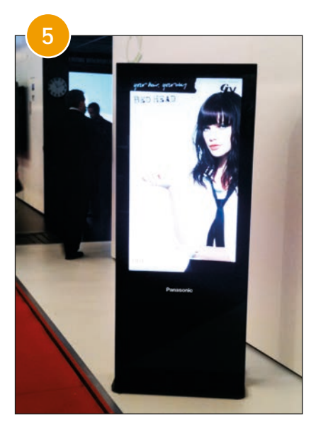
Portrait Kiosk Panasonic 47 inch Black