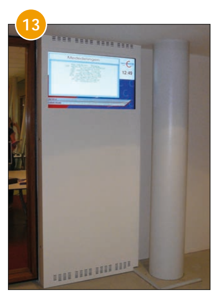
Flat Panel Cover Samsung 40 inch