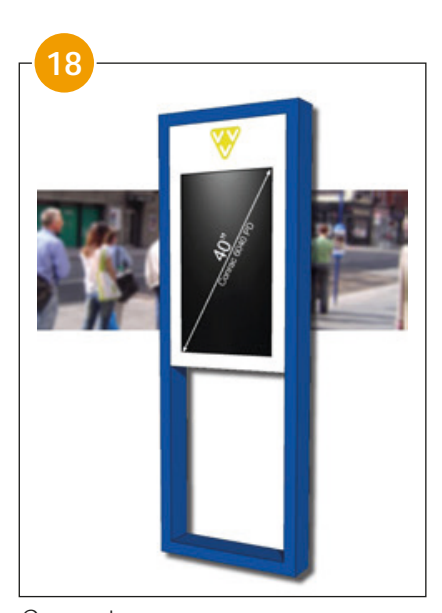
Concept: Outdoor kiosk Conrac 40 inch