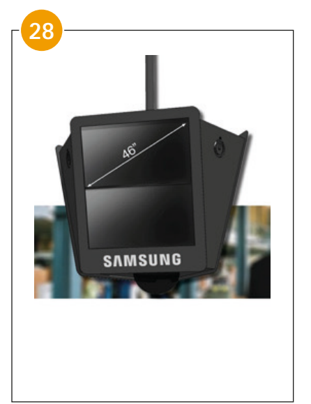
Concept: Diamond matrix Samsung 46 inch