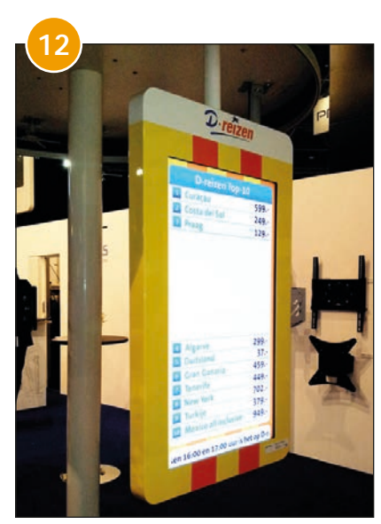
Flat Panel Housing LG 42 inch