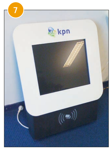
Check-In point ELO 19 inch