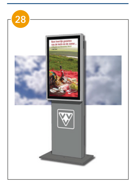
Concept: Outdoor kiosk Conrac 40 inch