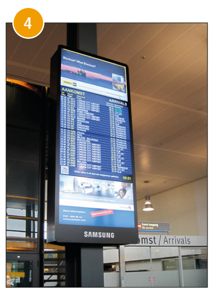
Matrix 1x4 Samsung 46 inch