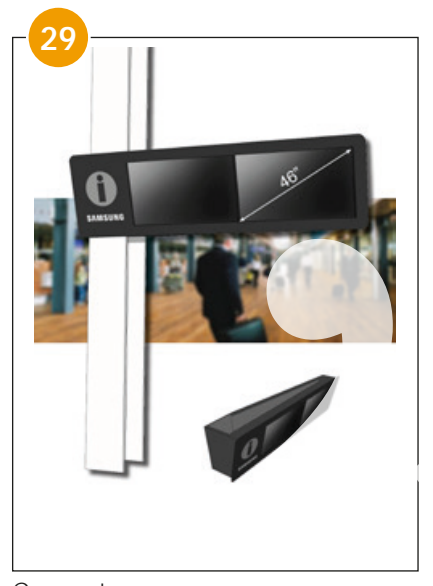
Concept: Matrix 2x1 Samsung 46 inch