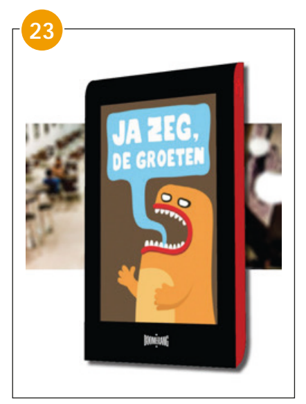
Concept: Flatscreen housing 46 inch