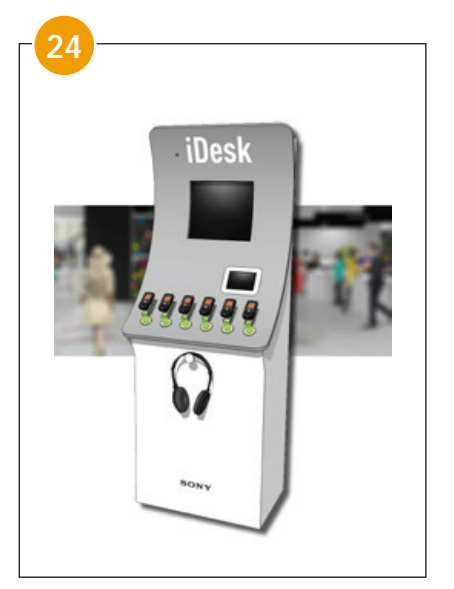
Concept: iDesk ELO 22 inch