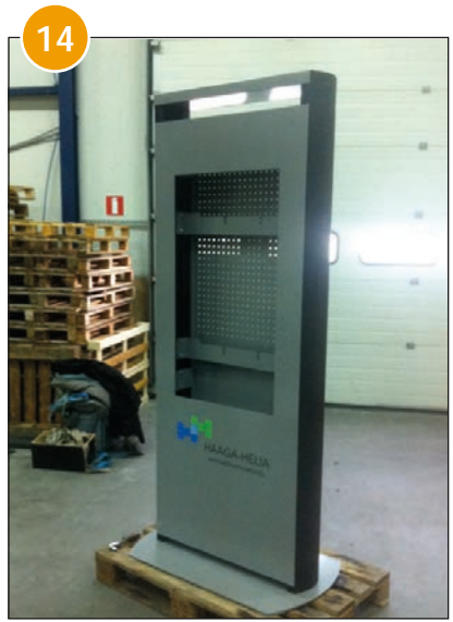
Touch Kiosk Hyundai 46 inch