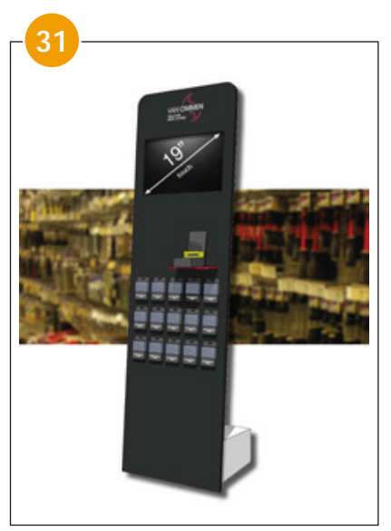
Concept: Presentation stand LG 19 inch