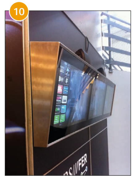
Flat Panel Housing Sharp 37 inch