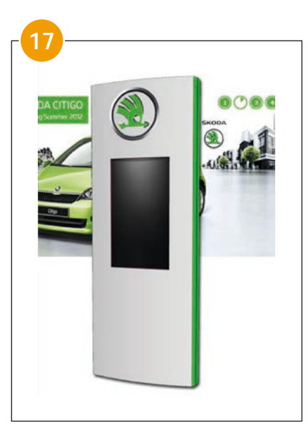
Concept: Outdoor kiosk Conrac 40 inch