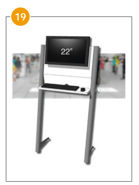
Concept: Internet stand LG 22 inch